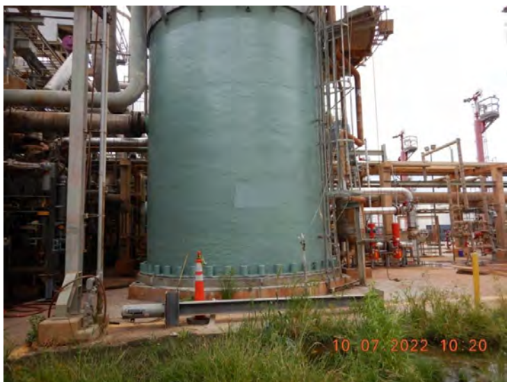
Figure 1: Intumescent Coating Application on Vessel Skirt