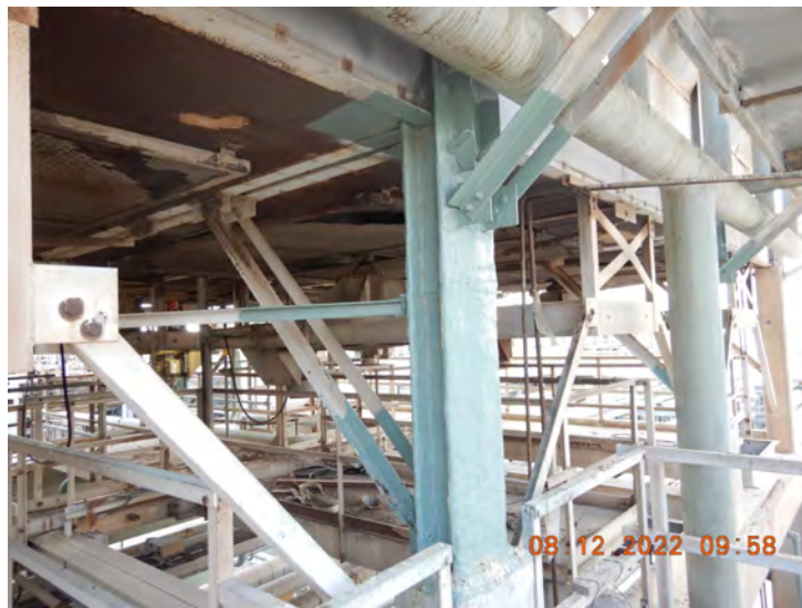
Figure 2: Intumescent Coating Application on a W Shape