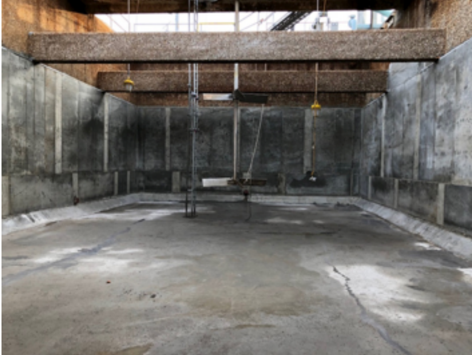
View of tank after cleaning – Ready for Inspection