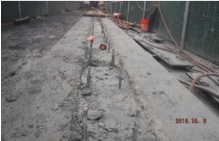
Typical View after Rail Removal