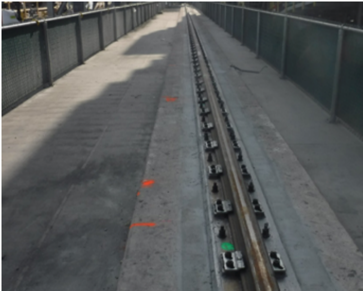
Example Completed Rail System